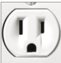
TYPE B NORTH AMERICAN NEMA 5-15 WALL OUTLET

The voltage aboard the yacht is 110v and the plug sockets around the boat will accept American plugs. See below for an example of the outlet onboard.