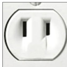
TYPE A NORTH AMERICAN NEMA 1-15 WALL OUTLET

For those from the USA, you don't need a power plug adapter in Mexico. Your power plugs fit. We recommend you to pack a 3 to 2 prong adapter in case type B sockets are not available. Your appliances with plug A and plug B fit.