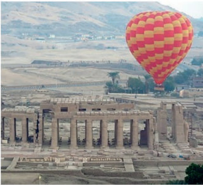
Hot Air Balloon Over Luxor