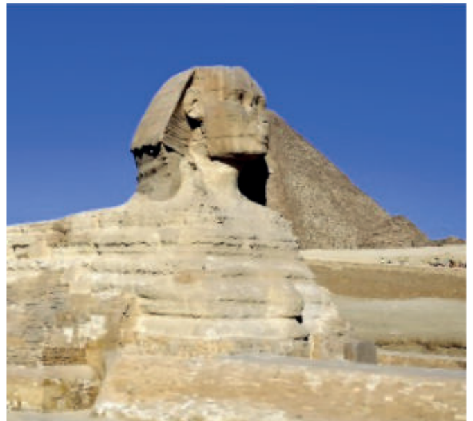
4 Day/3 Night Cairo & Giza Pyramids